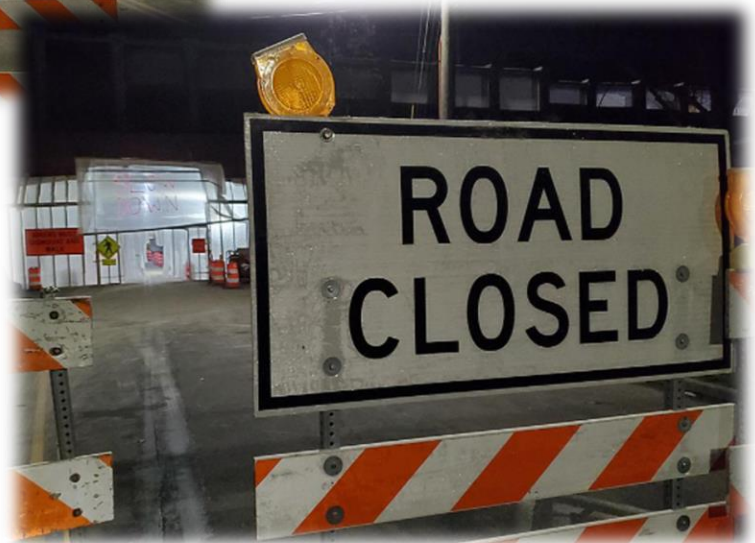
Chenango Street remains closed to vehicular traffic between Bevier and Frederick streets.