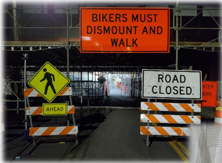
"Dismount and walk."