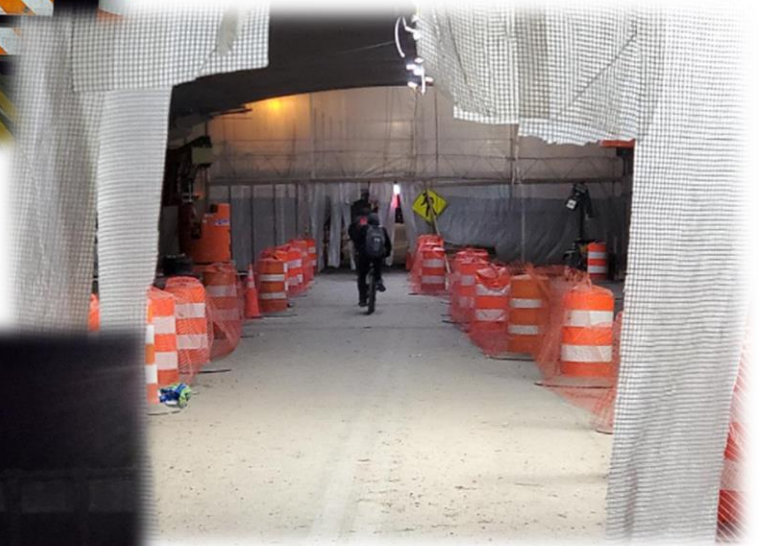
Two bicyclists decided the rules don't apply to them.