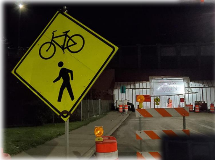
Although two bicyclists were seen, no pedestrians were observed during our brief visit.