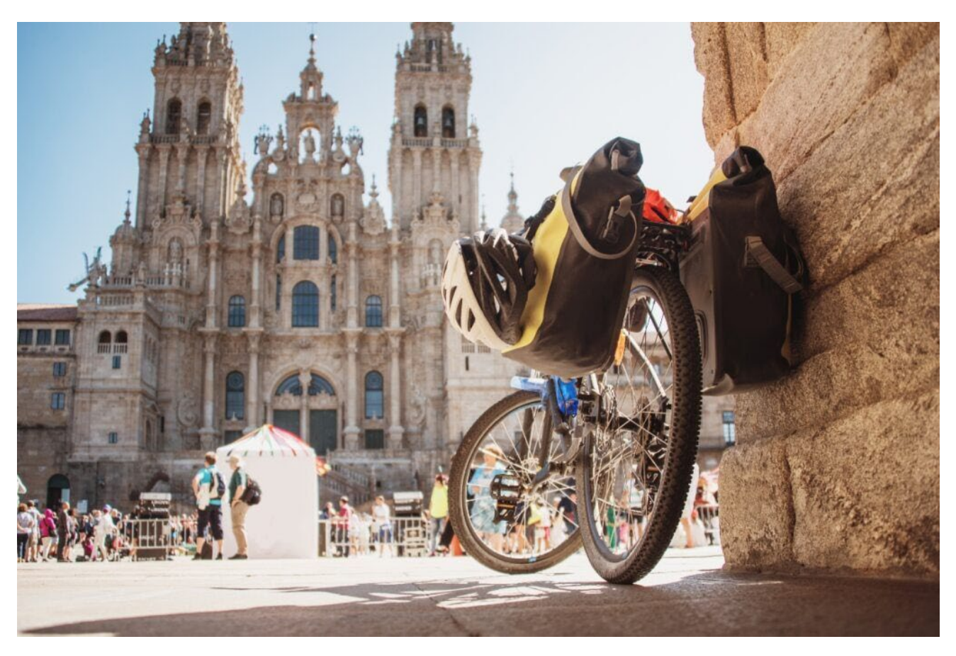
CYCLING TOURISM IS FLOURISHING.

public health. With billions of euros in benefits, cycling proves to be not just a wheel of fun but also a wheel of fortune.