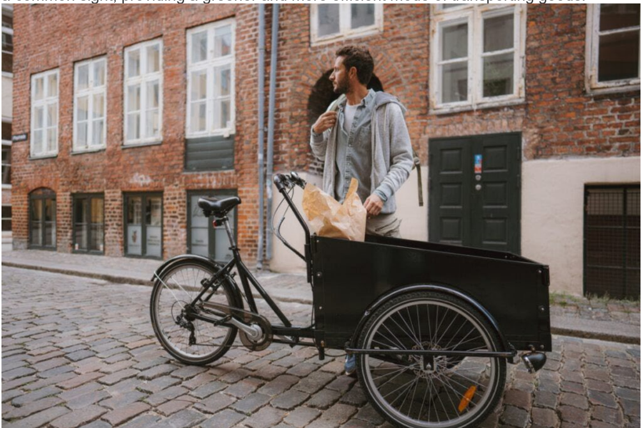
A CARGO BICYCLE USED FOR DELIVERIES.

Who says you need a truck for deliveries? Cargo bikes are changing the game when it comes to urban logistics. They could replace up to 25% of commercial deliveries and 77% of private logistics trips in urban areas. In cities like Copenhagen, cargo bikes have become a common sight, providing a greener and more efficient mode of transporting goods.