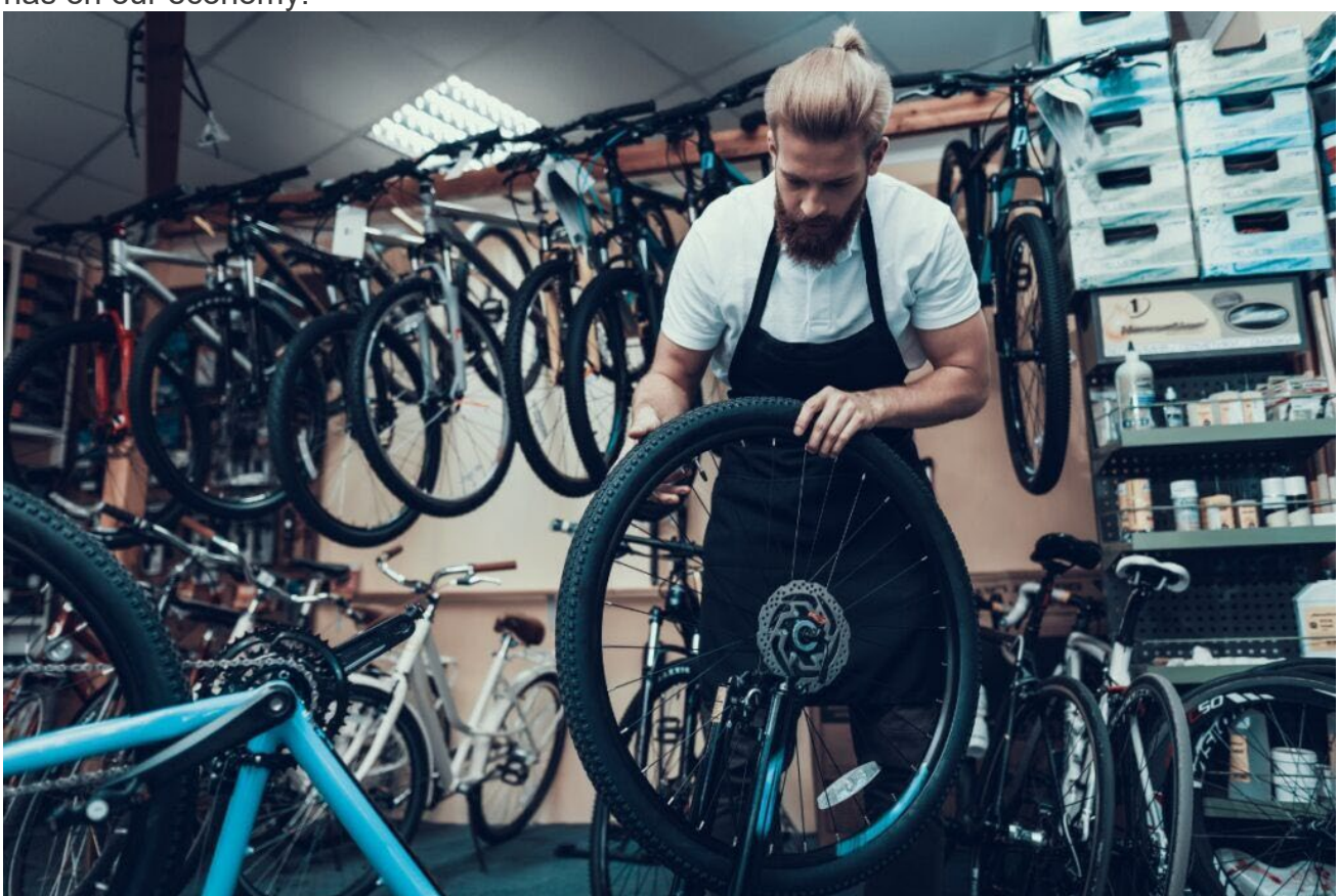
THE BUSINESS OF CYCLING.